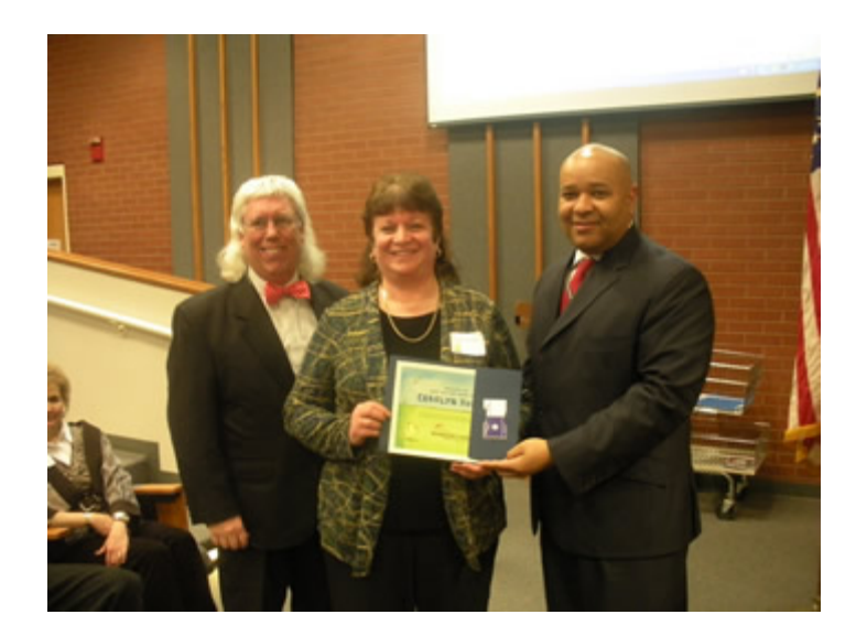
The "Team" received an award from the Appearance Commission recognizing the creation of the Arcadia Lakes Rain Garden on the site of the Tree of Life Synagogue on N. Trenholm Road.