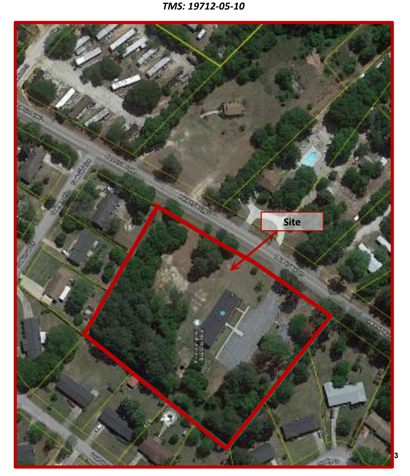
Case 19-004 SE First Spanish Baptist Church 7915 Old Percival Road Columbia, SC 29223