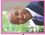
Overture E. Walker District 8