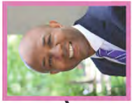
Overture E. Walker District 8