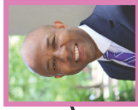
Overture E. Walker District 8