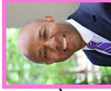
Overture E. Walker District 8