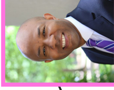
Overture E. Walker District 8