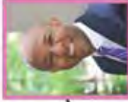
Overture Walker District 8