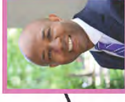
Overture Walker District 8