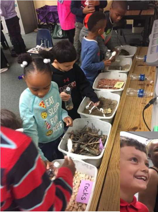
Above: Students learn about earth materials by creating compost bottles. Right: An EnviroScape watershed model demonstrates the movement of sediment and pollutants through the landscape.

RSWCD representatives are available to conduct hands-on conservation activities with preK-12 students throughout Richland County. Programs are tailored to meet students' needs and are aligned with the SC Science Academic Standards.