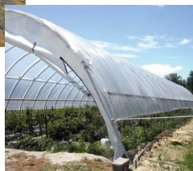
Photo to the Right: High Tunnel with side curtain raised to help with ventilation and also allows pollinators to enter