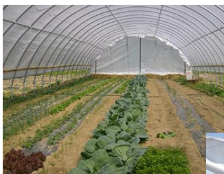
Photo to the Left: High Tunnel showing no irrigation system installed. Producer using garden hose and sprinkler to help establish irrigation history